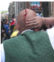
Owch! They're good