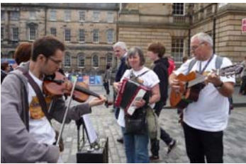
We were out in force every day with our musical troupe.

With a new show and so much competition, promotion was a big part of our week.