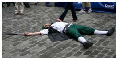
Dead pirate found on the Royal Mile-Japanese tourist found holding murder weapon

On the last 2 nights we had a full house, a considerable achievement. Somewhere along the line we still managed to find time to see a show or two. Amongst the favourites were "Destination GB""Scaramouche Jones", "Stephen K Amos", "Orphans", "White Tea" and "Potted Potter".